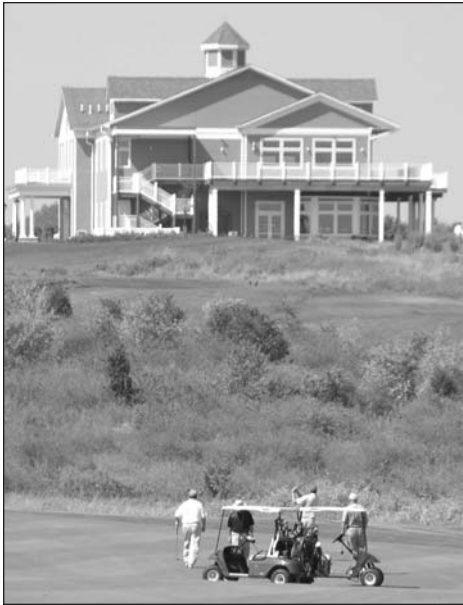
Neshanic Valley Golf Course clubhouse overlooking ADC Golf & Culinary Event foursome on the green.